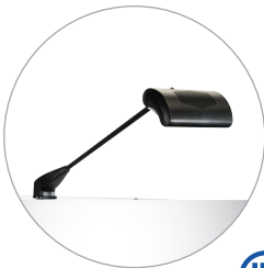
LED light kit (Optional)