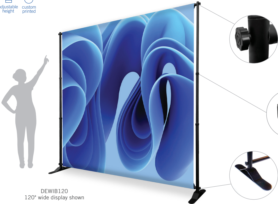
DEWIB120 120" wide display shown