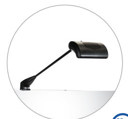
LED light kit (Optional)