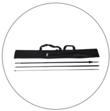
Durable fiberglass-graphite composite pole set with carrying case

Single-sided printing is visible on both sides (mirror image on the back). Double-sided printing ensures that the graphics on both sides read properly.