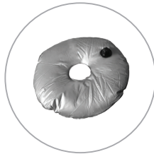
Water bag to provide additional weight (for use with X-base)